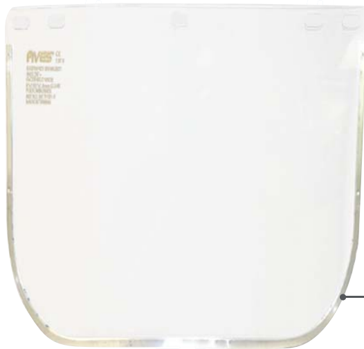
with Aluminum Frame